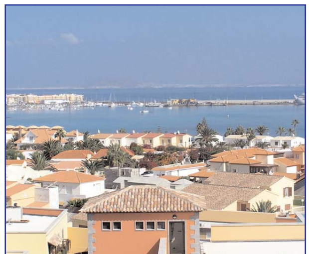
View towards Corralejo Harbour from the Clock Tower